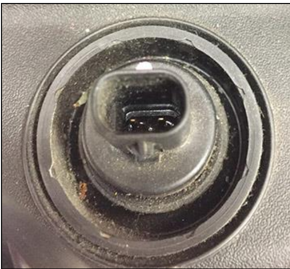
EARLY – 558-124