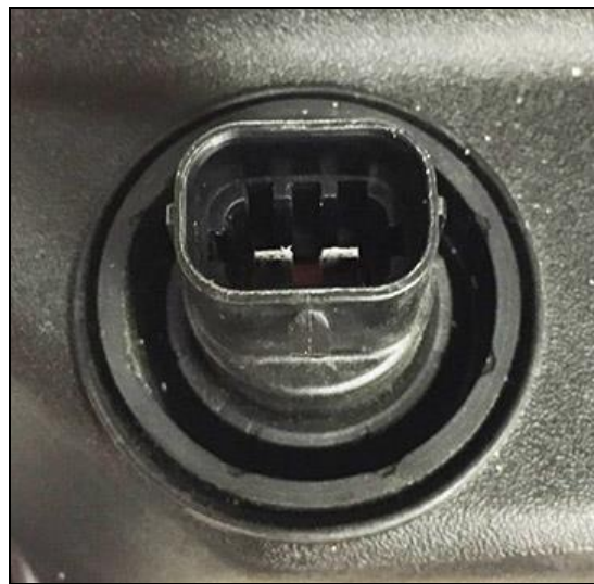
LATE – 558-125